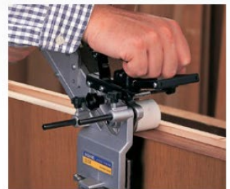
Banding the internal side of a lapped door.

For edgebanding preglued PVC, polyester, melamine and wood veneer. For the same types of banding as the AG98F. When using the lap banding guide, included in the machine set, it is possible to band the internal sides of doors, grooves or jamb cut outs.