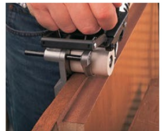
Banding the upper side of the lap.

Optional accessories 2800000 AU93 Edge trimmer 2100000 RC21E End trimmer 5246194 Roller at 4° specially designed for banding inclined surfaces on doors, etc.