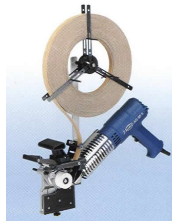
AG 98 E | Manual edgebander

For edgebanding preglued PVC, polyester, melamine and wood veneer. For the same types of banding as the AG98F. When using the lap banding guide, included in the machine set, it is possible to band the internal sides of doors, grooves or jamb cut outs.