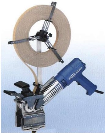
AG 98 F | Manual edgebander

For edgebanding preglued PVC, melamine and veneer. Enables banding of circular or shaped pieces. Its special design with adjustable clamps ensures high precision work with great stability. A practical edge trimming system included. The possibility of surface glueing or with excess on either of the two sides. Set up time: less than one minute.