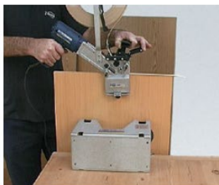
Enables banding of circular or shaped pieces.

Optional accessories 2800000 AU93 Edge trimmer 2100000 RC21E End trimmer 5246025 Roller inclined at 4° for edge-banding on inclined door surfaces, etc.