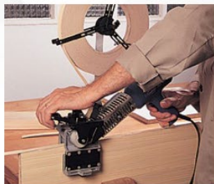
High precision and stability during edgebanding.

For edgebanding preglued PVC, melamine and veneer. Enables banding of circular or shaped pieces. Its special design with adjustable clamps ensures high precision work with great stability. A practical edge trimming system included. The possibility of surface glueing or with excess on either of the two sides. Set up time: less than one minute.